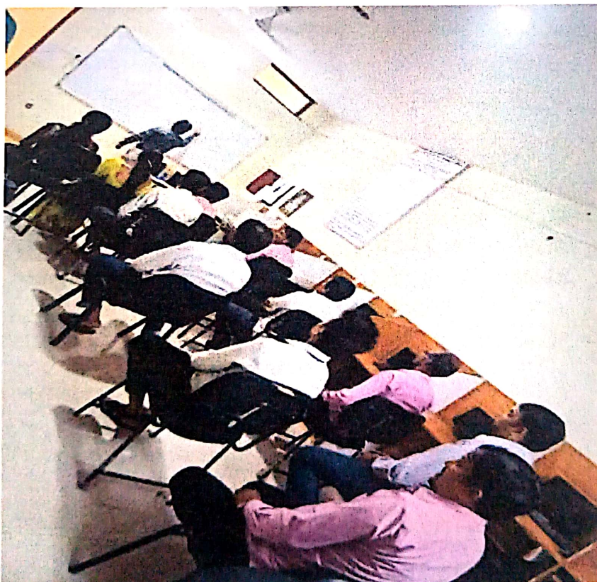
Non-Teaching staff getting information about software and hardware maintenance.